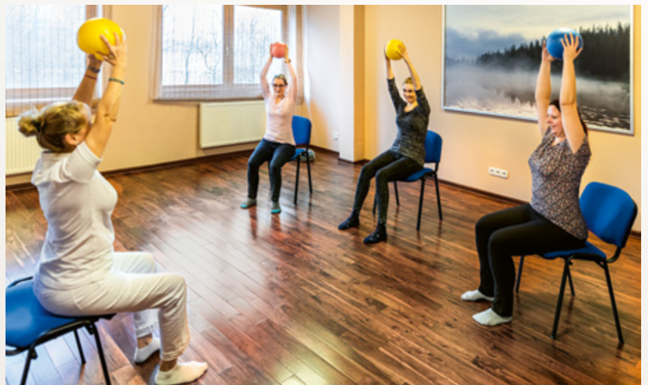
Group Therapeutic Physical Training