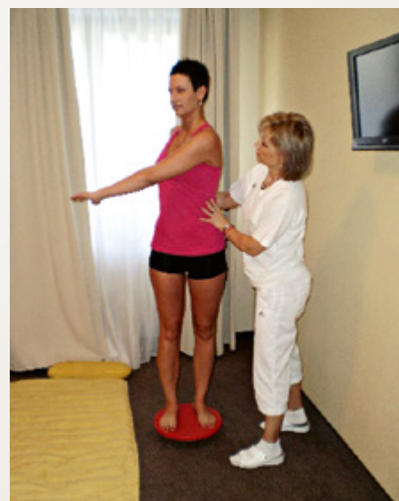
School for the Back