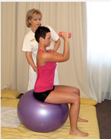
Individual Therapeutic Physical Training

Acute inflammatory diseases, bleeding and feverish conditions.