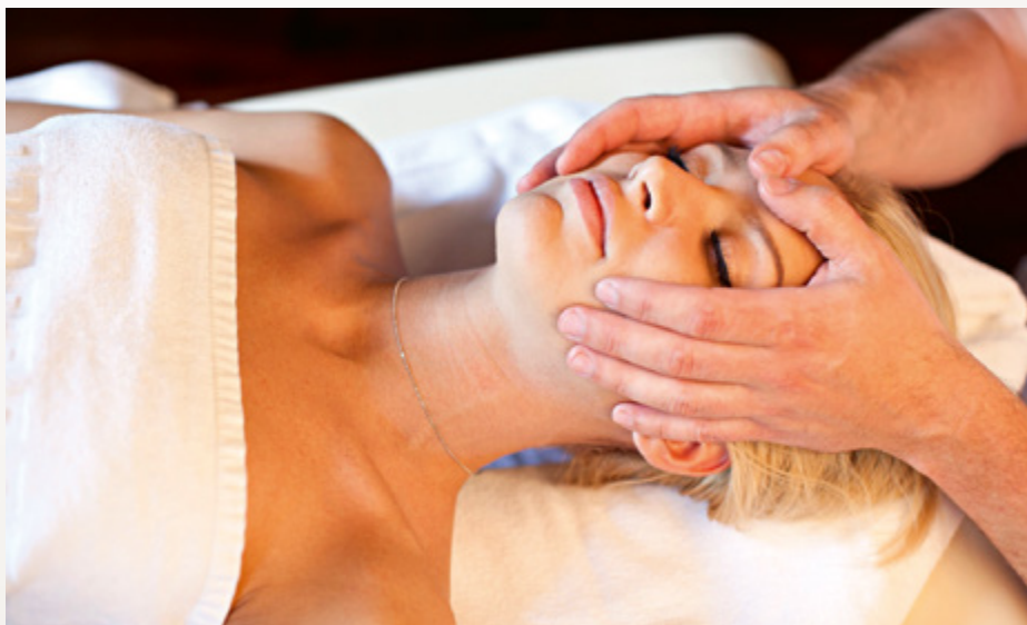
Lymph Drainage of Face and Décolleté

Allergy to cinnamon, virosis, fever, skin wound, eczema, fungus, diabetes, varicose veins, infections, pregnancy, epilepsy.