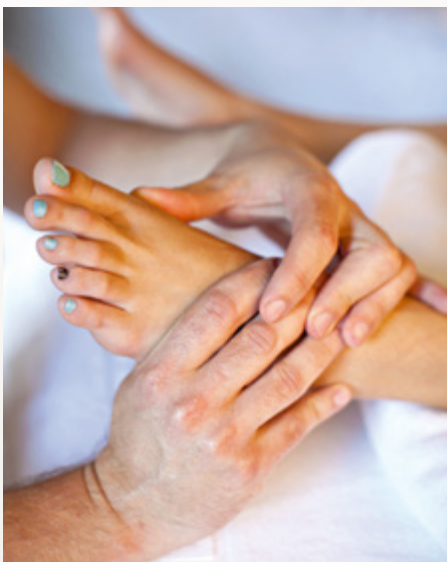
Reflexology Foot Massage

They are the same as in the reflexology foot massage.