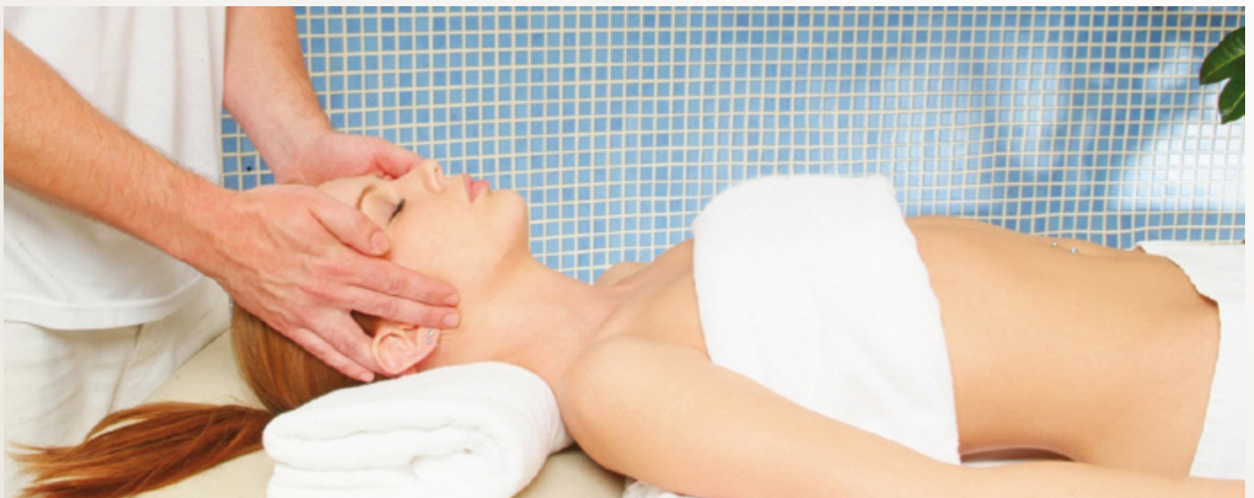
Ayurvedic Indian Oil Massage

Inflammatory and infectious diseases, eczema, warts, skin allergy, fever, fungal disease on the skin, acute oncological disease, enlargement of lymph nodes, varicose veins, pregnancy, breastfeeding, menstruation, epilepsy.