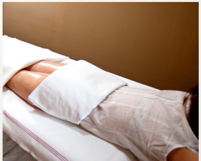
Grape-Lemon Detoxification Wrap